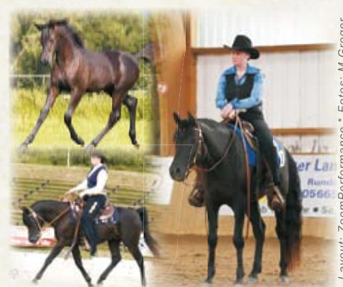
Layout: ZoomPerformance * Fotos: M. Groger

rein ägyptisch, Gefriersperma erhältlich